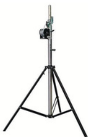
SoundKing DLC001 - Tripod Steel winch up stand with 1750-4000mm height adjustment, 85kg load capacity (Formerly WS4)