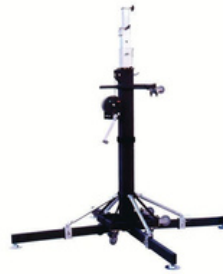
SoundKing DLB004 - Heavy duty Steel winch up stand with outriggers, 1770-5500mm height adjustment, 180kg load capacity