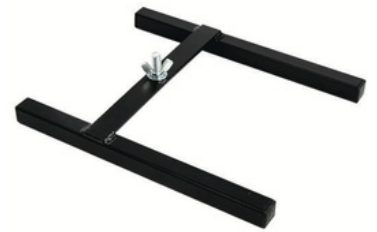
SoundKing HSTAND - Floor 'H' Stand