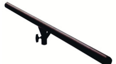
SoundKing DLT004 - 50mm Tubular Lighting T Bar to suit stands with 35mm Socket, 1520*150*50mm (Formerly TBAR3)