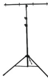
SoundKing DA006B - Steel Budget Lighting Stand with Square T Bar (25*25*950mm), 1100-2500mm height adjustment, 30kg load capacity (Formerly LTS6)