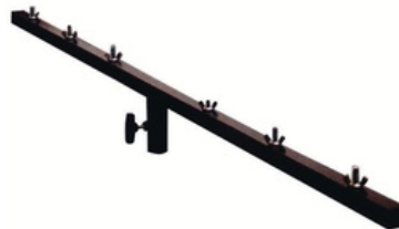
SoundKing DLT001 - 30mm Square Section Lighting T Bar with 6 bolt holes for fixtures to suit stands with 35mm Socket, 1520*30mm (Formerly TBAR1)