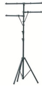
SoundKing DA009 - Aluminium Lighting Stand with T Bar and Side Arms, 1450-3250mm height adjustment, 60kg load capacity (Formerly LTS1B)